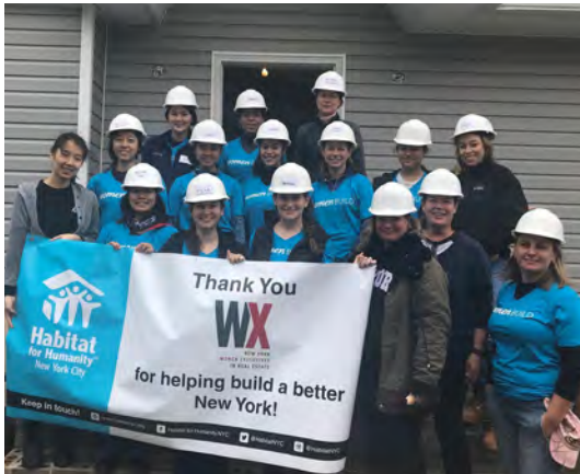
WX MEMBERS AND MENTEES volunteering at the WX Women Build

It was great to catch up with our WX friends as we worked together on the project.